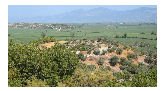
Figure 7 The sanctuary of Aphrodite of Oikous near Miletus

Although the name Oikous does not explicitly refer to seafaring, the spectrum of finds in the sacrificial pits and waste layers within the sanctuary provides insight into this aspect. The presence of votive inscriptions written by women and terracotta female figurines indicates that the sanctuary was visited by women who were praying for fertility. On this point the archaeological evidence is in agreement with the written records. Conversely, a considerable number of votive objects were brought to the sanctuary from a considerable distance. Notable among the finds are pottery from all parts of the Mediterranean, statuettes from Cyprus and the Phoenician-Syrian region, as well as rich Egyptian finds. Although it is possible that these foreign objects may have been acquired by the local Milesians, who subsequently dedicated them to