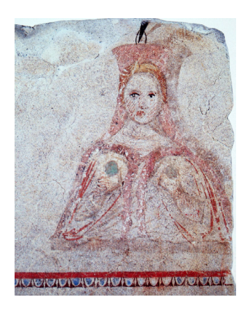
Figure 12 Depiction of a protome from a cistgrave, Thessaloniki Archaeological Museum

The protome is the most common terracotta type, in which the body is depicted as a single section from the head to the waist. This half-figure form emerged in the Late Archaic period (c. 6th century BC) and gradually replaced the older, more limited type, which depicted a smaller section of the body from the head to the base of the chest.