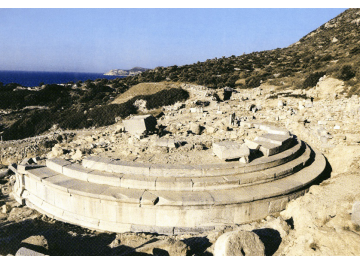
Figure 6 Round temple on the uppermost terrace in Knidos

Nevertheless, the attribution of this edifice in Knidos to Aphrodite Euploia is currently discredited. Subsequent research and analysis have demonstrated that the round building in question was, in fact, a closed structure with a cella wall. In other words, Aphrodite Knidia could not be viewed from all sides. It was also established that the round temple was constructed in the 2nd century BC, approximately 150 years after Praxiteles. Further excavations and research revealed inscriptions attributed to the goddess Athena on the round terrace, and thus Aphrodite could not be proven to be the owner of the sanctuary. It is also possible