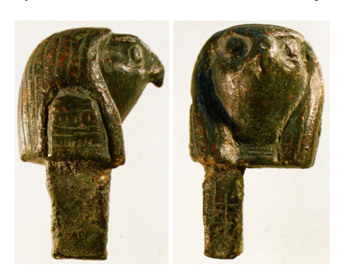
Figure 8 Bronze falcon head from Egypt, Miletus, Museum

Although the name Oikous does not explicitly refer to seafaring, the spectrum of finds in the sacrificial pits and waste layers within the sanctuary provides insight into this aspect. The presence of votive inscriptions written by women and terracotta female figurines indicates that the sanctuary was visited by women who were praying for fertility. On this point the archaeological evidence is in agreement with the written records. Conversely, a considerable number of votive objects were brought to the sanctuary from a considerable distance. Notable among the finds are pottery from all parts of the Mediterranean, statuettes from Cyprus and the Phoenician-Syrian region, as well as rich Egyptian finds. Although it is possible that these foreign objects may have been acquired by the local Milesians, who subsequently dedicated them to