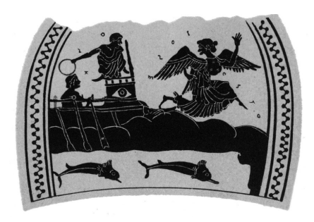
Figure 3 Drawing of the depiction on an oinochoe, Thebes, Museum

It is therefore relatively straightforward to envisage the circumstances in which, following days and weeks spent at sea in adverse conditions, seafarers arriving safely in a harbour felt compelled to express their gratitude for the safety they had been provided. It is reasonable to posit that a visit to the sanctuary of Aphrodite in one of the harbour towns was a common practice among seafarers. However, it was also customary for seafarers to pray and make offerings before embarking on a voyage. A depiction by an Athenian artist on an oinochoe (a type of jug, pottery), which is in the Theben Museum corroborates this assertion. The image depicts a seafarer engaged in a prayer ritual before embarking on a voyage. A male figure is depicted crouching on the bow of the ship, holding a wreath which he is about to throw overboard. In a swift and decisive manner, Nike approaches the ship, promising a successful voyage. According to some researchers, the ancient Greek letters that can be read on the depiction can be interpreted as the sentence 'Protect it (the ship)'.