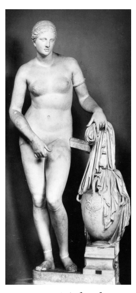
Figure 4 Aphrodite Colonna, Rome, Vatican Museums, 812, around 350 BC.

The sanctuary of Aphrodite Knidia/ Euploia in Knidos was renowned in antiquity. The cult's prominence was largely due to the statue created by Praxiteles, which was erected in the temple of Aphrodite and was a source of great fascination due to its remarkable appearance and beauty. This statue was the first example of a life size statue in which a goddess was depicted in the nude. The cult image still attracted a considerable number of tourists during the Roman Empire. This is precisely why Knidos never sold the Knidia statue, despite the receipt of attractive offers. Although the original sculpture by Praxiteles is no longer extant, copies and depictions created during the Roman period provide a comprehensive understanding of its original form.