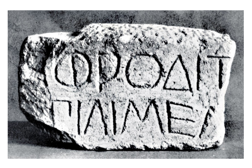
Figure 9 Fragment of an anchor votive for Aphrodite Epilimenia, Aegina, Museum

Consequently, the nature of the offerings made to a deity may also provide insight into the identity of the individuals who consecrated have them. In addition to the international character of the offerings, it should be noted that a small