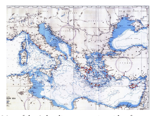
Figure 2 Map of the Aphrodite sanctuaries with reference to the sea

M. Eckert found in his study that the vast majority of Aphrodite sanctuaries located near the sea actually have a connection to seafarers. Most of them are located at harbours or close to them at important nautical points. The sanctuaries can be located within a settlement or trading centre, but can also be outside the city walls on a beach or landing place.