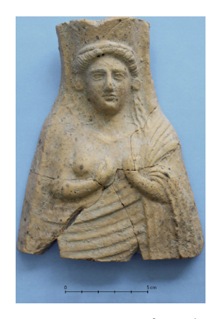
Figure 11 Protome from the Aphrodite sanctuary of Kaunos, Fethiye, Archaeological Museum