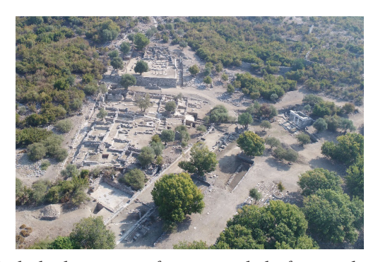
Figure 10 The harbour agora of Kaunos with the fountain house (right) and the harbour stoa (centre)

a monumental columned stoa dating from the 1st quarter of the 3rd century BC. During the excavations in the hall, the entrance to a cult room, which was apparently added to the stoa at a later date during the Roman period, was uncovered at the rear of the hall. In the room, a podium on which an altar had previously been erected was discovered. The altar, which is in the form of a relief, depicts various gods, including Aphrodite holding the infant Eros in her arms. The prominent depiction of Aphrodite on the altar has led to the assumption that the cult was dedicated to the goddess of love. This hypothesis was corroborated by the discoveries made in the vicinity of the cult area. In addition to the pottery, a significant number of terracottas dating from the Late Archaic to Hellenistic periods were discovered in various excavations. These terracottas can be interpreted as votives of an Aphrodite cult.